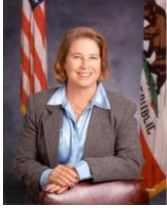
Honorable Denise Ducheny 40 th Senatorial District