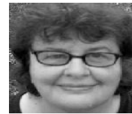
Carroll Boone Nonviolence Network San Diego